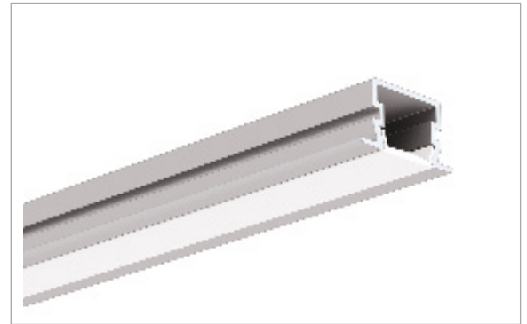
K-PDS-NK PRODUCT CODE