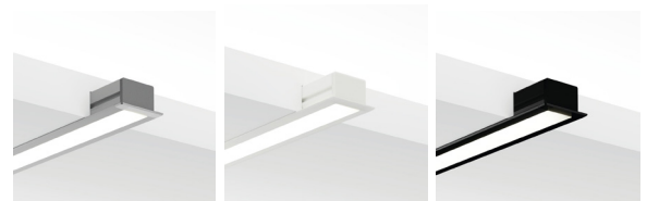
■ Silver anodised □ White Lacquered ■ Black anodised