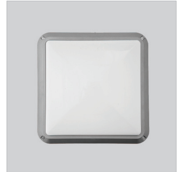
Microwave Sensor available as an accessory.