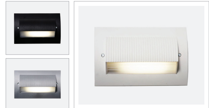
Microwave Sensor | Minimal Heat