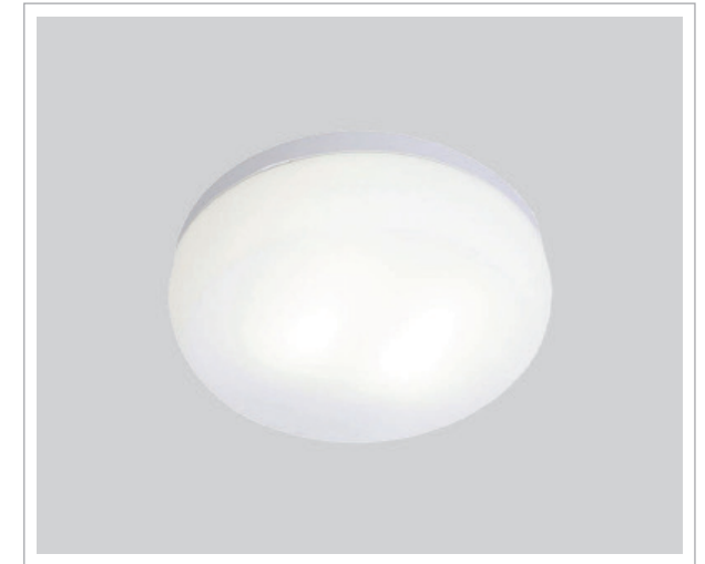
SR-10L PRODUCT CODE

** If your preferred light source is not listed above, please contact us as more options are available.