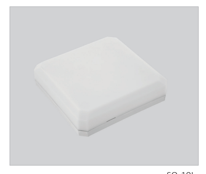
SQ-10L PRODUCT CODE